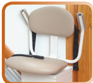
Optional Flip-Up Arms