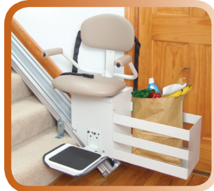
Optional Grocery Basket