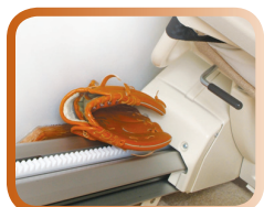
Safety sensors on carriage and footrest stop the lift instantly at obstacles.

As with all Pinnacle stair lifts, the HD model is engineered to the highest industry standards and designed for optimal comfort, convenience and aesthetics.