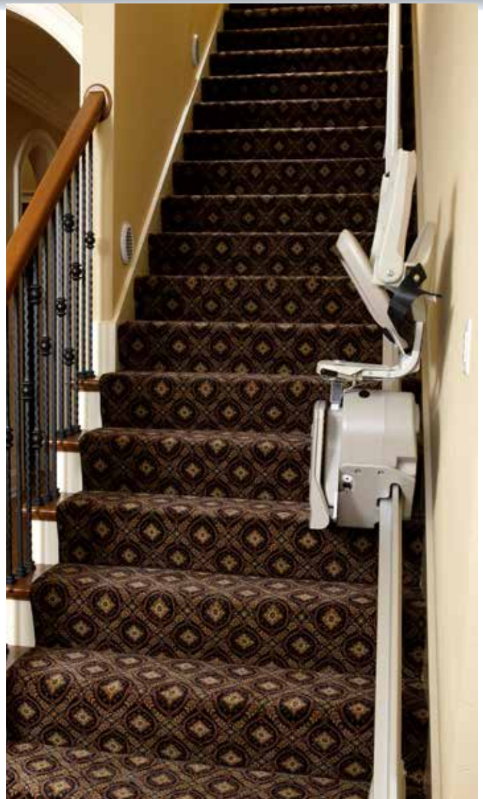
Compact, flip-up design for plenty of open space on stairway.

“Staff was very professional and helpful. The chair is wonderful and I will recommend the product and company.”