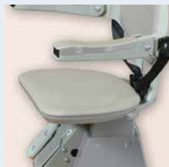
Power swivel seat for effortless exit. Armrest switch control or wireless call/send.