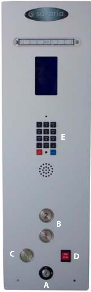
Figure 1: Sample COP