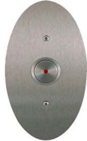
Figure 3: Hall Call

In the event of a building power failure, the system is provided with a temporary power back-up system to allow the elevator to run down to the next available landing, or to the first floor landing. On resuming normal building power, the back-up system will turn OFF and begin automatic recharging.