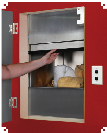
Shown in optional Stainless Steel finish