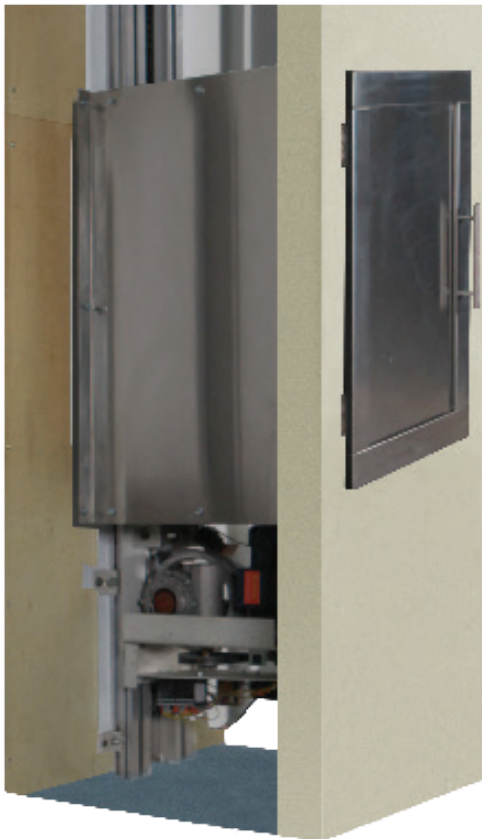
Car and drive system are pre-installed on a section of track. Extra lengths splice together easily.