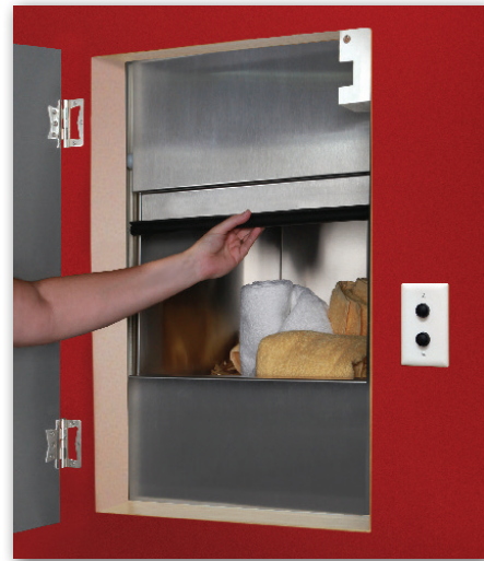
Easy-open, bi-parting car doors. Shown in optional Stainless Steel.

Intelligent design sends Ascent to the top of the list for easy installation and reliable use. Its unique drive train, pre-mounted track and simplified plug-n-play wiring can take hours off installation time. Users enjoy simple use, durability and easy maintenance for years to come.