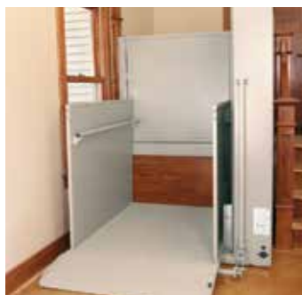
Vertical Platform Lifts