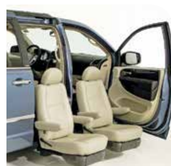
Valet® Signature Seating